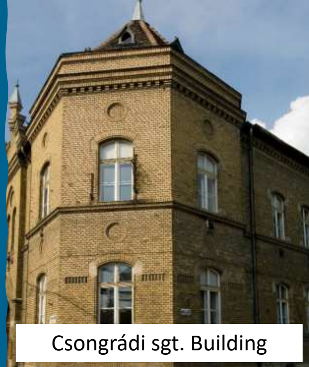
Csongrádi sgt. Building

Institute of Vocational Training, Adult Education and Knowledge Management