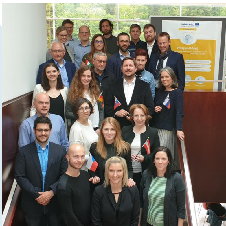
Group photo of the partnership at the ProsperAMnet kick-off meeting on 6-7 May 2019