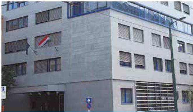
NAV Office in Bocskai u.