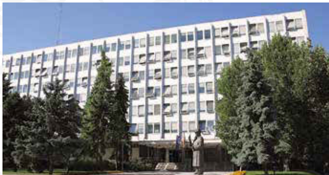
Government Office in Rákóczi tér

➔ www.hszi.u-szeged.hu/files/static/Student-ID-application.pdf