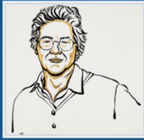
Anne L'Huillier Nobel Prize in Physics