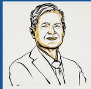
Ferenc Krausz Nobel Prize in Physics