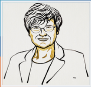
Katalin Karikó Nobel Prize in Physiology or Medicine

The EUGLOH community is honoured to have strong connections to four of the 2023 Nobel Prize winners: